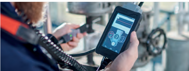
Digital ultrasonic testing device SONAPHONE®