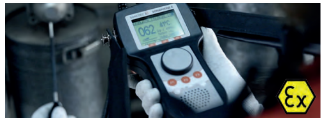
SONAPHONE E for use in hazardous areas