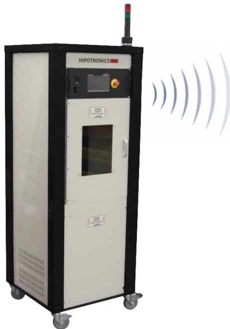
50kV unit (pictured above) Example of oil bath & test cell (pictured below)

The D149-DI Series of AC Dielectric Breakdown Testers represents a new level of sophistication, flexibility and accuracy in breakdown voltage testing. Each unit is equipped with a new standard embedded firmware controller that is internally programmed to perform the ASTM D149 short-time test, step-by-step test and slow rate-of-rise test. This unit can also be easily programmed to perform variations of these test sequences. The voltmeter circuit continually samples each waveform to determine the breakdown voltage with the highest accuracy. The operator can control all test parameters as required. When testing is complete, all breakdown information for that series of test samples are automatically recorded. Standard units are available in 30kV, 50kV, 75kV and 100kV AC for a wide variety of applications. Contact the factory for DC or partial discharge testing requirements, and to inquire about modernization of existing systems.