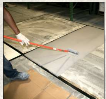
SuperBond ™ is a surface tolerant primer with an extended overcoating window.