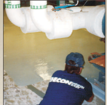
SuperBond ™ is an excellent bonding agent for almost any flooring material.

SuperBond ™ can even be used as a bonding agent for permanent immersion applications such as in swimming pools or on ships' hulls. It cures chemically, transforming the bond-line into a highly durable, waterproof film.