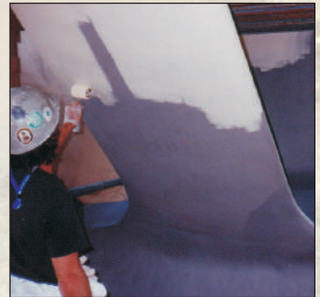
SuperBond ™ is ideal for immersion applications.