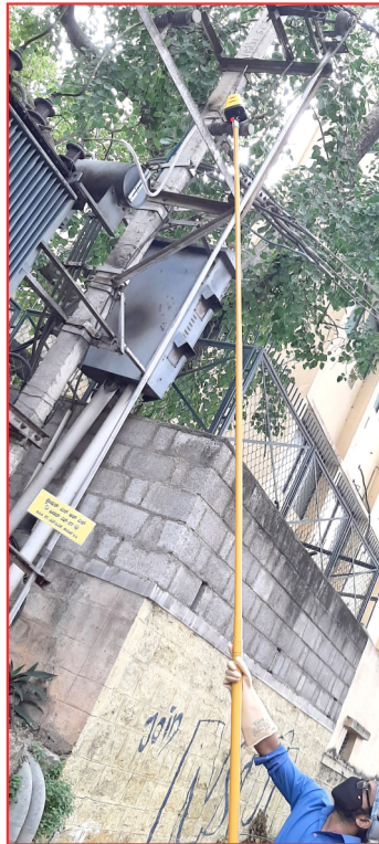
TEST USING MODEL D5