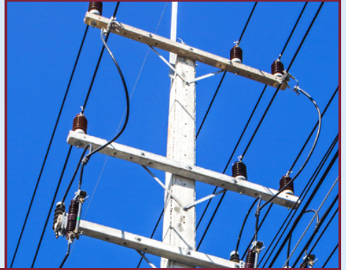
MEDIUM VOLTAGE 11kV to 66kV