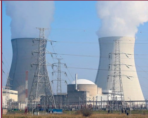
HIGH VOLTAGE 66kV to 132kV