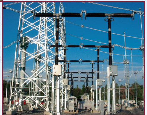
ULTRA HIGH VOLTAGE 400kV to 765kV