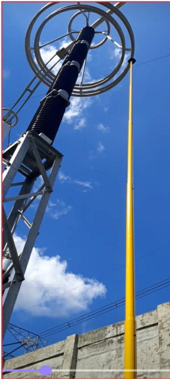
TEST USING MODEL T5

A wide range of voltage selector switch, helps user to confirm the level of the Induced voltage presence after switching off the Line.