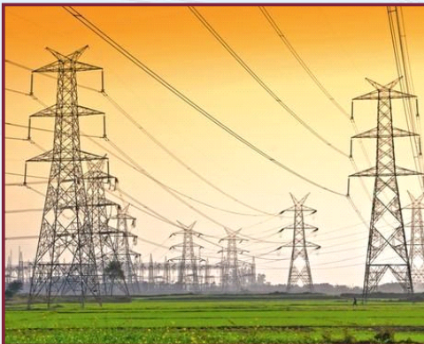
EXTRA HIGH VOLTAGE 132kV to 400kV